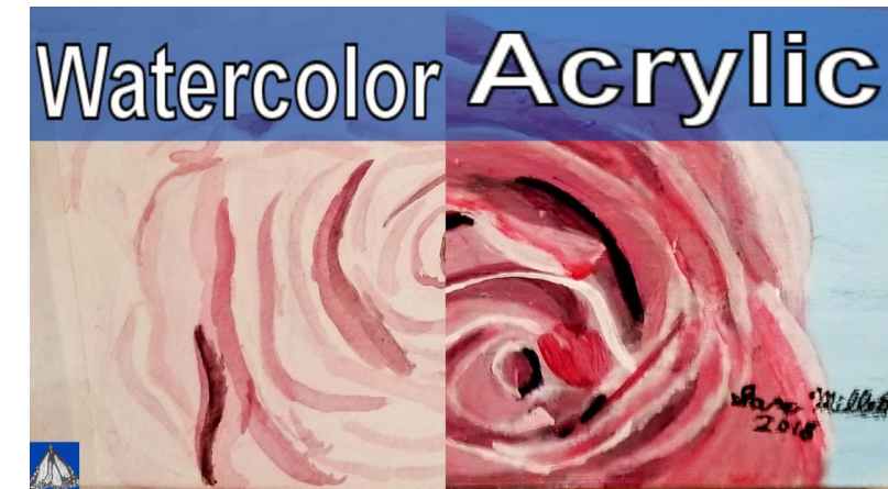
Wet media examples

Joel Penkman's compositions are simple still-life studies with clean backgrounds to make easier for individuals to make a connection. Food triggers memories and emotion, she like that people can bring something of themselves to the artworks.