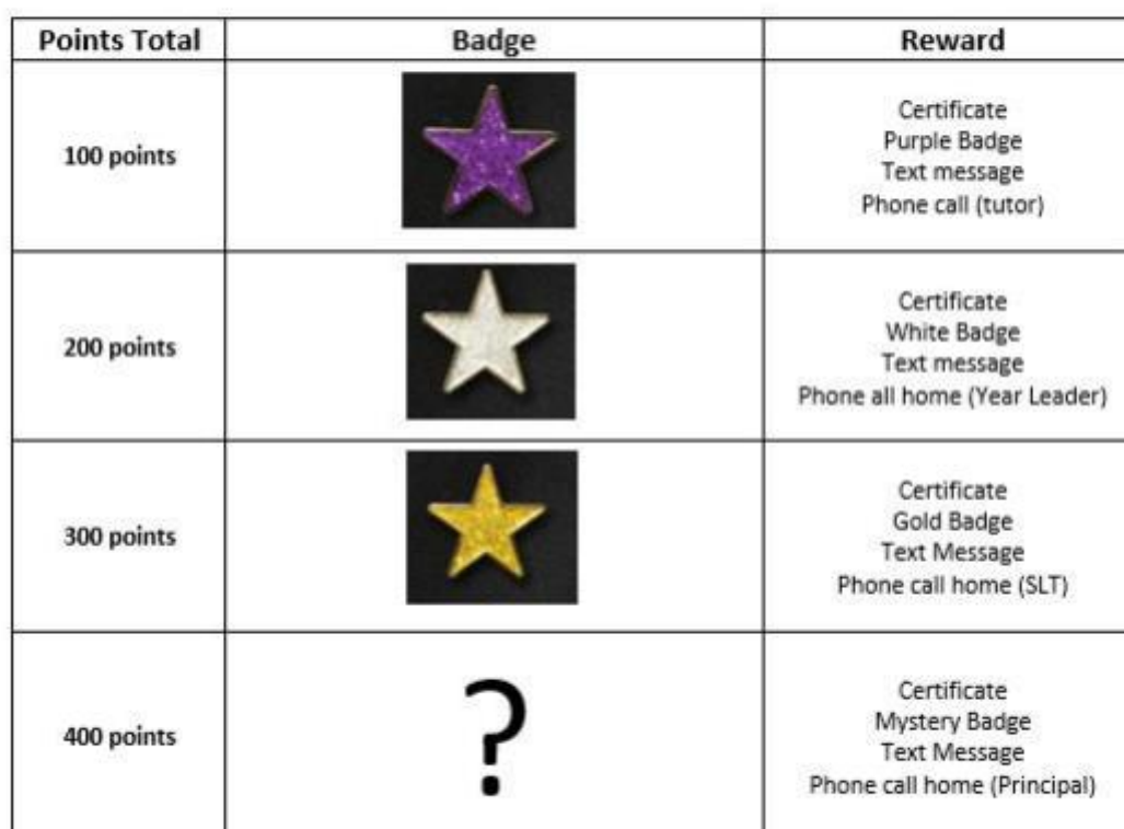
Star Rewards House Point Structure

Star Rewards To reflect the accumulation of positive points over the academic year students work towards achieving star badges. The star badges reflect point targets being achieved by students.